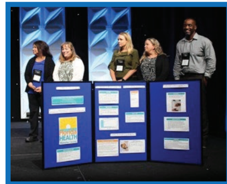
Florida Department of Health In Manatee County

For more information on the Storyboard Competition, please contact: Florida Sterling Council at (850) 922-5316 or registration@thesterlingcouncil.org