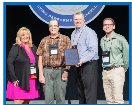
Justice Administrative Commission

For more information on the Storyboard Competition, please contact: Florida Sterling Council at (850) 922-5316 or registration@thesterlingcouncil.org